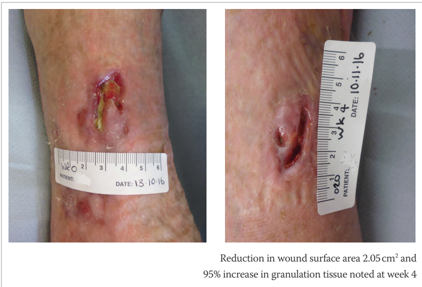
Figure 4. A patient with a lower limb wound treated with KerraCel over a 4-week period. The MLU before and after 4-weeks dressing with KerraCel

The evidence to support the use of KerraCel on hard-to-heal wounds of various aetiology in the lower limb is limited and further research needs to be conducted on the generalisability of these findings to the wider population. However, this case series evaluation highlights the benefits associated with the appropriate use of KerraCel in retaining exudate to promote a moist wound healing environment, whilst protecting the periwound skin from complications associated with soft tissue maceration. WUK