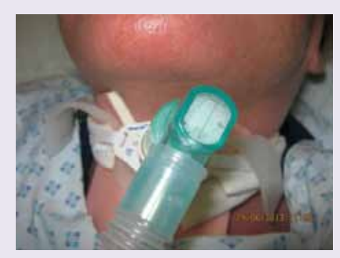
Figure 26: Aderma can protect the skin under the tracheostomy flange in patients who have had tracheostomies.