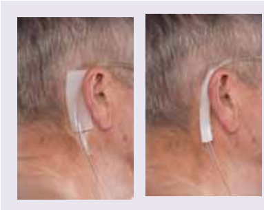
Figure 21: PUs can occur on the ears where several devices may be squeezed into a tight space. Dermal strips can be rolled around tubing to minimise the risk of pressure damage. If additional fixation is required, silicone tape can be used to hold the tubing and the dermal strip in place.