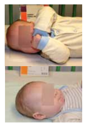
Figure 6: The prevention of occipital PUs is one of the most popular uses of Aderma in paediatric practice.