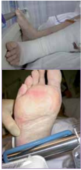
Figure 15: Ensure the patient's foot does not rest on the foot of the bed or on equipment (top), as this can lead to pressure damage (bottom).