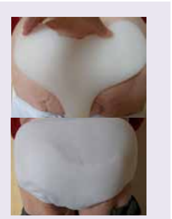
Figure 13. Aderma Sacrum in-situ.