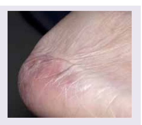
Figure 14. Early signs of PU in the heel area. Further damage was prevented through the application of dermal heel pads. PUs on the heel occur frequently and can lead to significant morbidity and mortality (Black, 2012).

The dermal pads were easily removed for physiotherapy sessions and after five days the patient was mobilising with a Zimmer frame. In this case, the patient found the dermal pads more acceptable than pressure-relieving boots.