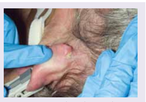
Figure 22: A patient admitted to critical care who previously had been receiving oxygen therapy through a nasal cannula. Dermal strips applied at the beginning of oxygen therapy may have prevented this lesion.

Figure 21: PUs can occur on the ears where several devices may be squeezed into a tight space. Dermal strips can be rolled around tubing to minimise the risk of pressure damage. If additional fixation is required, silicone tape can be used to hold the tubing and the dermal strip in place.