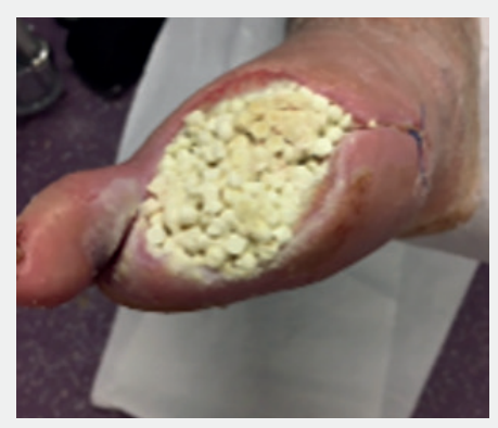
Figure 1b: Treatment