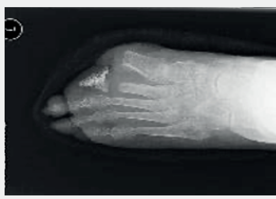
Figure 3c: X-ray 6 weeks post-operation

He had a left superficial femoral artery (SFA) angioplasty and stent 2 years previously. He had been scheduled for a left-sided downstream SFA/popliteal artery intervention; however, at the time his foot was stable, and this was cancelled due to the COVID-19 pandemic. The patient was admitted with chronic limb-threatening Ischemia (CLTI) of the left foot, and necrotic left first and second toes, extending to the dorsum of the foot [Figure 3]. He also had worsening pain at rest.