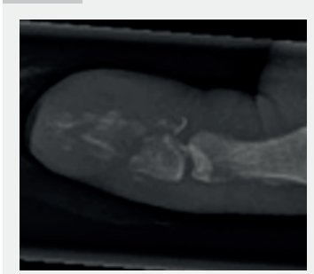
Figure 2a: On presentation