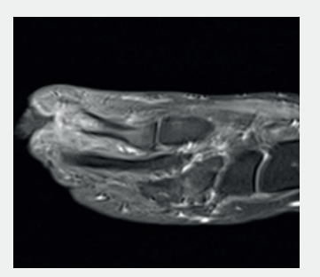
Figure 2c: MRI on second admission