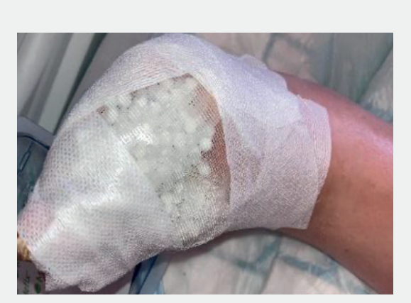
Figure 3b: Post-operation