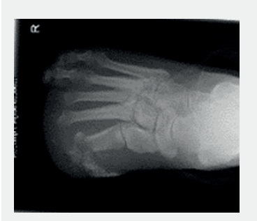
Figure 2e: X-ray 4 weeks postoperation