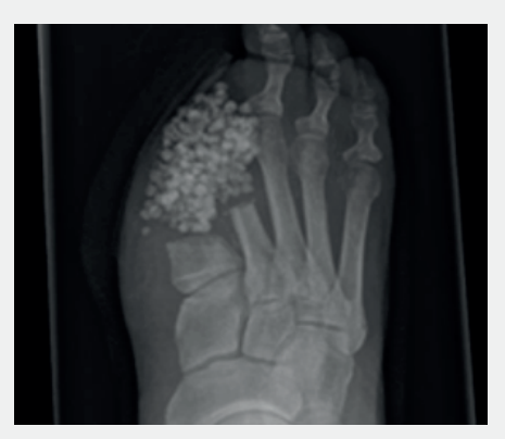
Figure Ic: X-ray post-implantation