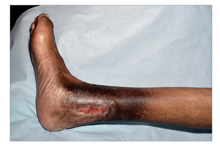
Figure 1. Leg ulcers occur ten times more frequently in persons with SCD than in the general population

into that of a crescent and the cell is then said to be sickled (NHLBI, 2014). The sickled cells become dehydrated, rigid and are less able to negotiate the circulatory system, becoming trapped and lodged (Figure 2) within the smaller blood vessels resulting in ischaemia and tissue necrosis (Trent and Kirsner, 2004). SCD was initially thought to be solely related to abnormal haemoglobin (HbS), however, it is now acknowledged that there are many complex mechanisms that form part of the disease process. The primary process is the alteration of the red blood cell producing the defective form of haemoglobin where the morphology of the cell is altered and it has a weakened cell membrane (Conran et al, 2009; Jones et al, 2013). A consequence is occlusion of the vessels and damage to organs supplied by the vessels. The vessel obstruction by sickled cells increases venous and capillary pressure and decreases the oxygencarrying capacity of the blood (Koshy et al, 1989).