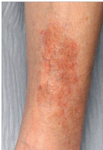
Figure 2. NLD in pre-tibial area with early onset plaque present