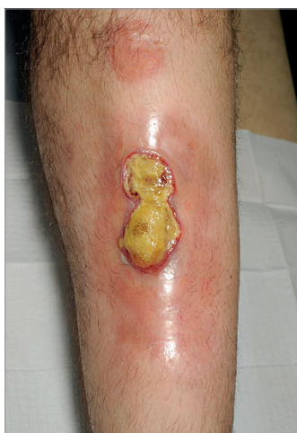
Figure 3. Active NLD lesion

most important role in the pathogenesis of NLD. Whereas glycoprotein deposition on the vascular wall of skin capillaries due to the underlying diabetes results in the lower oxygen tension within the lesion (Basoulis et al, 2015). There is a school of thought that views NLD as a primary disease of collagen with inflammation occurring as a secondary event (Mazur et al, 2011).