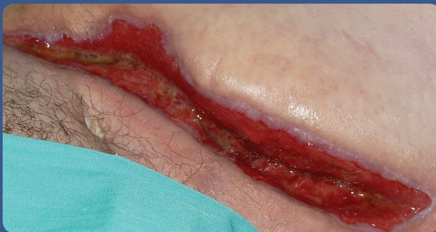
Figure 3. Wound 30 days after being treated with NPWT, 68cm 3 .

In this case, NPWT proved both beneficial and cost-effective for managing a large, challenging wound. This treatment was chosen following a thorough holistic