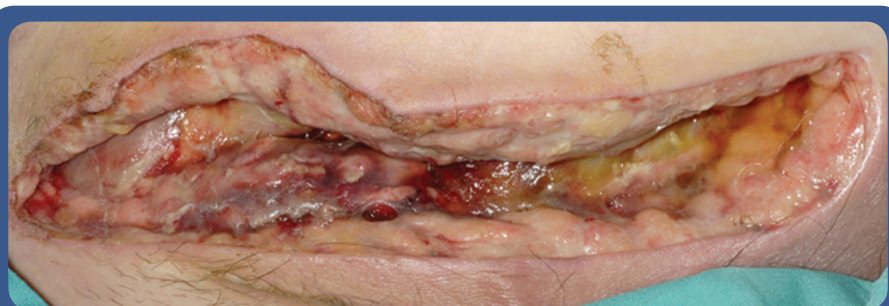
Figure 2. Wound post surgical debridement, 300cm 3 .

There are several NPWT medical devices available with two different wound bed interfaces: foam or gauze. Borgquist et al (2009) suggested that less force is required to remove gauze and there is no tissue in-growth into the dressing. They concluded that patients may experience more pain on removal of foam dressings and that the morphology of the wound bed tissue differs under foam and under gauze, i.e. there is a greater degree of leukocyte infiltrate and tissue disorganisation under foam.