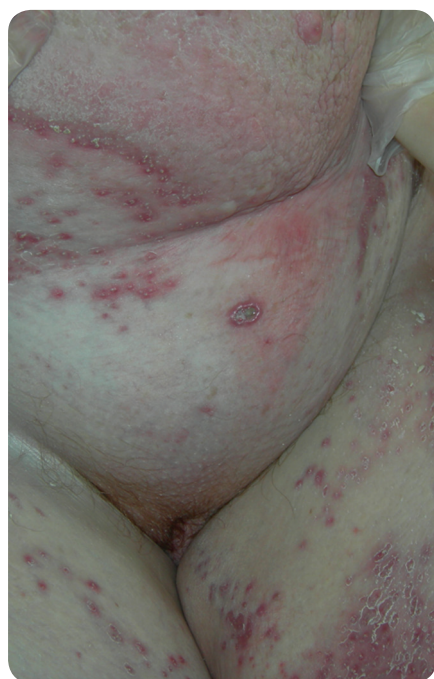
Figure 1. Healing fungal infection.

Krasner and Kennedy-Evans (2001) identified five wound types associated with bariatric patients, namely: