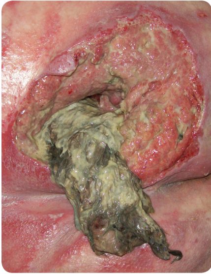
Figure 4. Grade 4 pressure ulcer to the sacrum with profuse exudate.

surrounding skin is soggy, as epithelial tissue is unable to migrate across the new granulation tissue. In this case, excess moisture was aggravated by lymphorrhoea, which can cause an increased risk of infection and maceration (Wingfield, 2009).