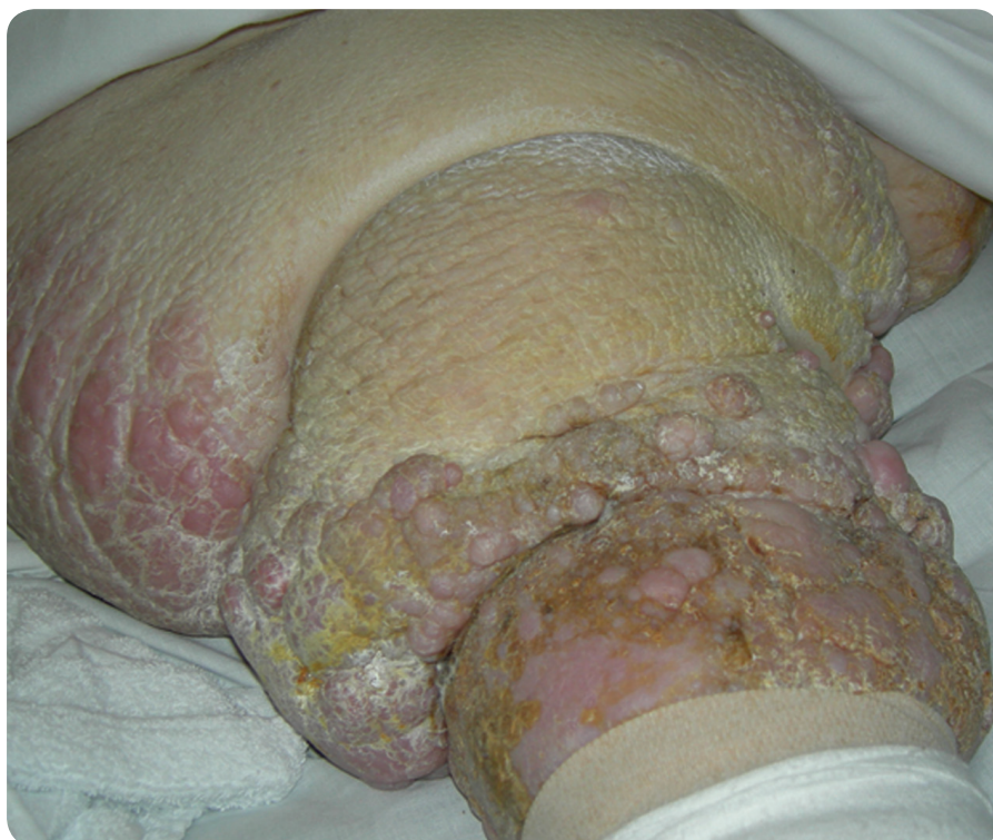
Figure 2. Typical lymphoedematous leg.

= recreational movement, T = therapeutic, and S = spiritual).