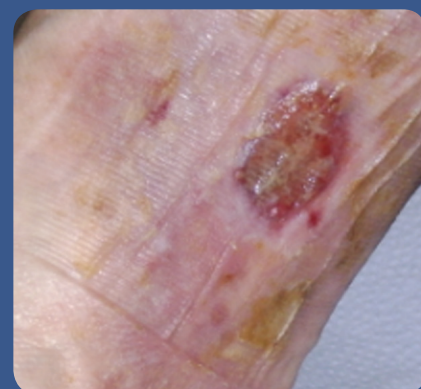
Figure 1. Right leg before treatment.

Following an appointment with the vascular surgeon, Thelma was referred to an outpatient leg ulcer clinic in February 2009. A silver dressing (UrgoCell® Silver) was used to clear the infection. When the infection was cleared, the nurse decided that it was time to try a new treatment. The wound was chronic (more than four to six weeks' duration) and stuck in the inflammatory phase, suggesting that there was probably a high level of protease enzymes (Tren Grove et al, 1999; White, 2008). This is when Thelma tried UrgoCell® Start (soft-adherent foam dressing with TLC-NOSF providing protease inhibiting properties and designed to rebalance the wound and promote faster healing in chronic wounds [Schmutz et al,