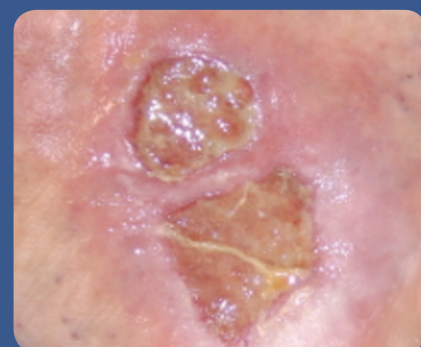
Figure 2. Left leg before treatment.

2008]). The nurse's decision to try this product was based upon clinical evidence available (RCT, observational study involving more than 2,000 patients etc; ), supporting its clinical efficacy, pain management and long-term cost-effectiveness.