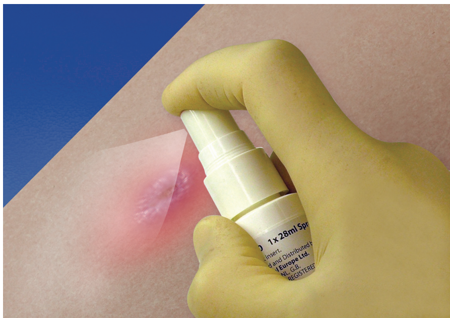
Figure 2: Sorbaderm being applied using the spray format.