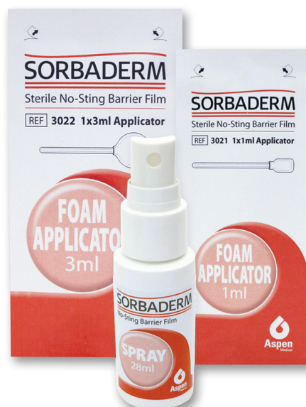
Figure 1: Sorbaderm® No-Sting Barrier Film.