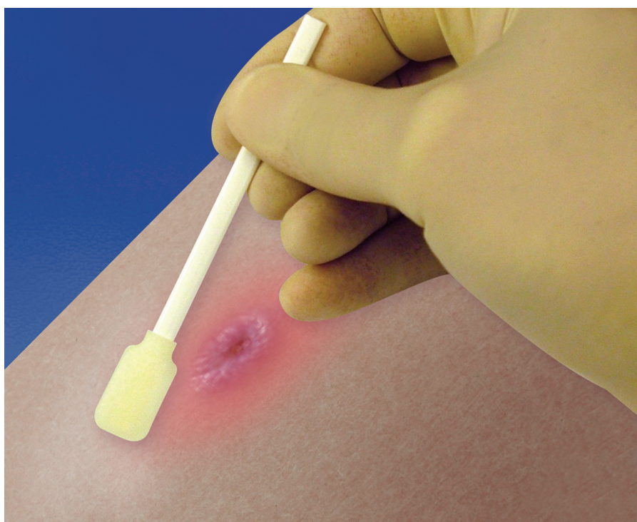
Figure 3: Sorbaderm being applied using the applicator.