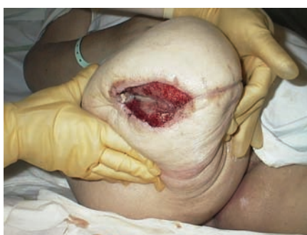
Figure 7. Below-knee amputation dehisced due to a restricted blood supply. Note the dark, discoloured unhealthy appearance of the granulation tissue.

carbohydrates provide the energy required during cell division and cell replication (Wysocki, 1992). Essential vitamins and minerals such as zinc, iron and vitamin C are also vital to the wound healing process and its success.