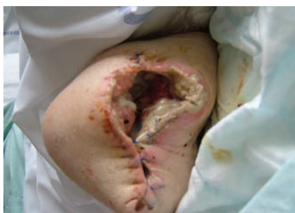
Figure 6. Above-knee amputation dehisced due to a restricted blood supply and excessive wound exudate.