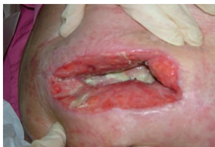
Figure 8. Abdominal wound dehiscenced due to mechanical stress likely to be caused by obesity.