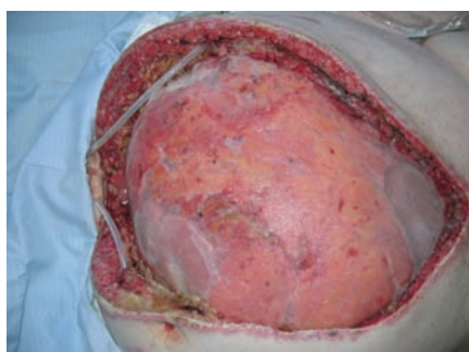
Figure 9. Abdominal wound with mesh visible, dehiscenced due to the presence of excessive oedema.

principles of care are to keep the wound clean and dry, assess for any complications and remove sutures or staples when the wound is healed. If complications arise, practitioners should be able to assess and identify the causative factors as a priority so that they can be managed effectively and wound healing can be achieved. WE