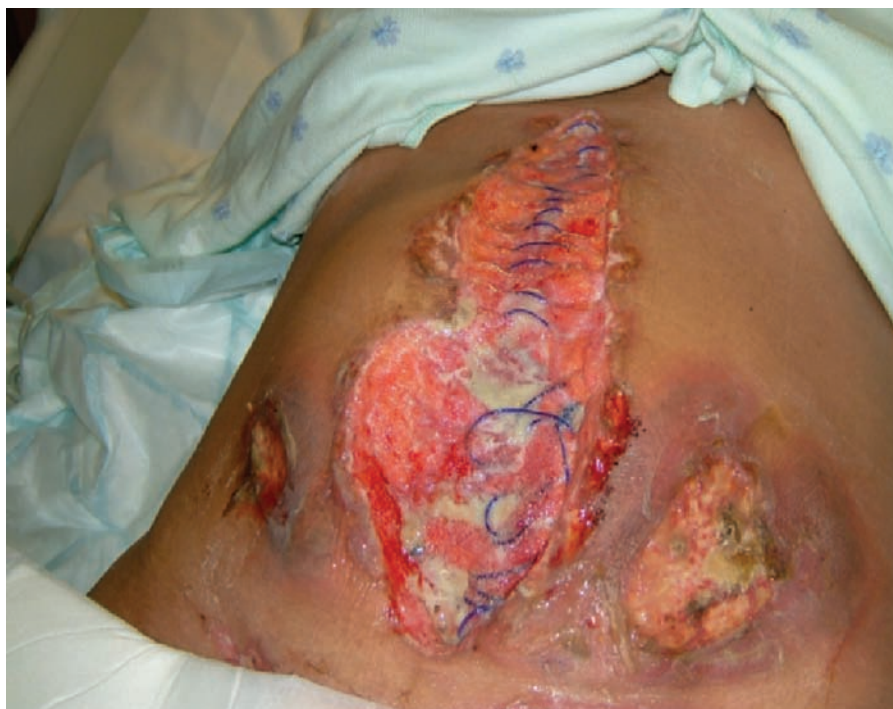
Figure 2. Dehisced laparotomy wound with deep tension sutures visible and bilateral drain sites necrosed due to wound infection.

preferably a sample of pus if available) should be obtained to identify the causative bacteria. A wound should not be swabbed unless clinical signs of infection are present or routine screening processes are required. This is because wound swabs will identify the presence of bacteria in the majority of wounds, however, antibiotic treatment is only necessary if this bacteria is affecting the wound healing and clinical signs of infection are present (Kingsley, 2001; Bale et al, 2000).