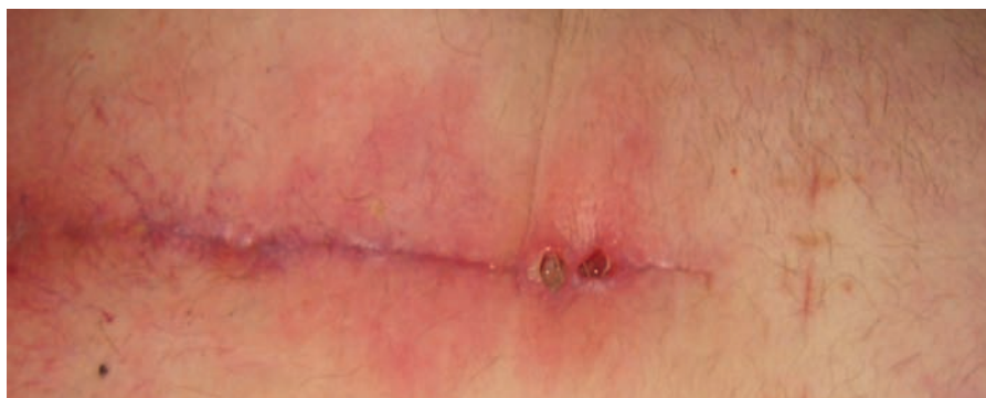
Figure 1. Methicillin-resistant Staphylococcus aureus (MRSA) infection following cardiac surgery. This wound has clear signs of infection shown by the erythematous area surrounding the dehisced wound and the purulent appearance of the exudate.