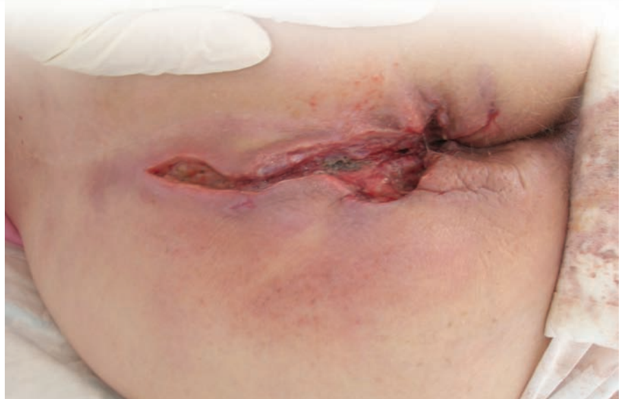
Figure 1. A pilonidal sinus, which has been incised, drained and laid open to allow drainage of exudate.

A congenital pilonidal sinus develops in patients who have a predisposition to the condition because of a 'dimpling' of the natal cleft. It is thought that these patients have a remnant of the caudal segment of the neural canal. Hair and dead skin cells