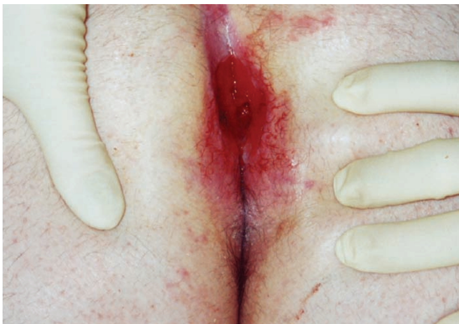
Figure 4. A pilonidal wound 15 months after initial surgery, showing unhealthy granulation and pocketing.

layer of skin and fascia that is applied to the wound site. Because the 'flap' retains its own blood supply it can 'take' readily and reduce the likelihood of recurrence (Timmons, 2007).