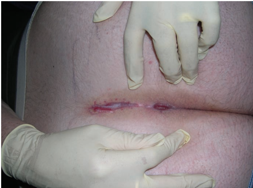
Figure 3. Wound healing 12 weeks post-wide excision.