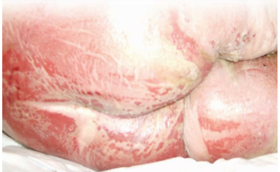
Figure 1. Incontinence dermatitis; the skin is red, inflamed and painful.

Extensive guidelines have been published in order to aid healthcare professionals in managing individuals with both faecal and urinary incontinence (Scottish Intercollegiate Guidelines Network [SIGN], 2004; National Institute