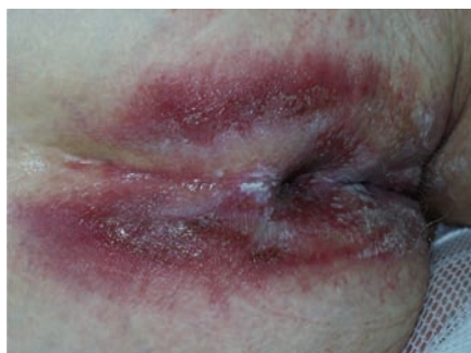
Figure 2. Moisture lesion formed due to increased skin pH and moisture.

The skin's protective secretions, natural oils produced by the sebaceous glands, enable it to maintain a naturally acidic pH, usually between 4.0–5.5 (Berg, 1988). This is often termed the