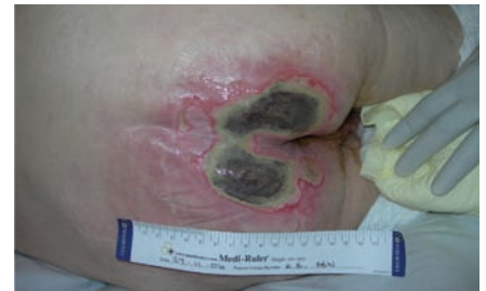
Figure 3. Pressure ulceration has formed in the sacral and peri-anal area secondary to a moisture lesion.

Clostridium difficile is a gram-positive, spore-forming anaerobic bacteria, which is found in a small