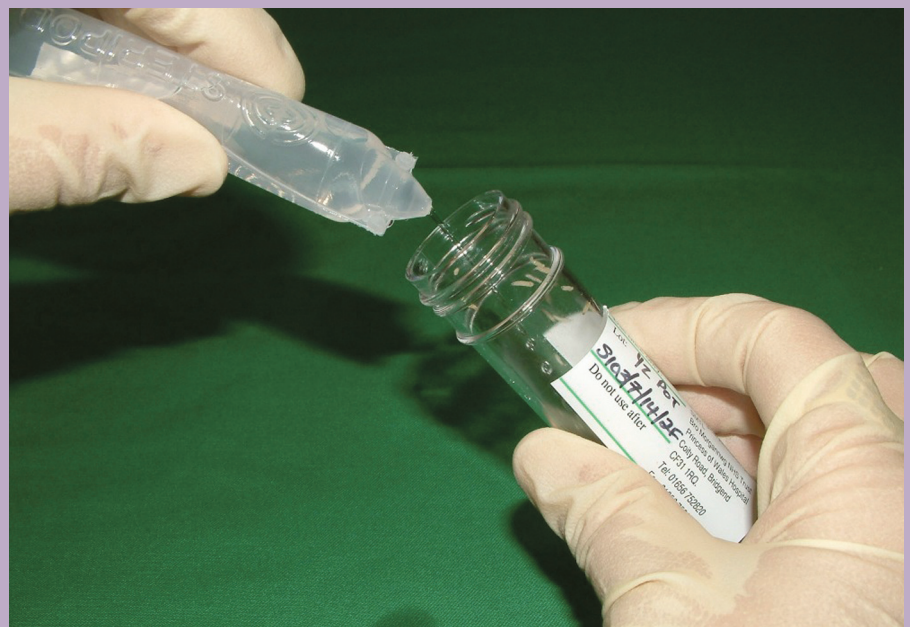
Figure 3. Saline is added to the LarvE.