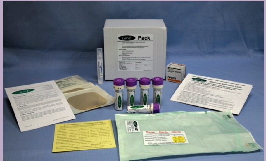
Figure 1. Free-range LarvE pack.

A full patient assessment should be undertaken to ensure that