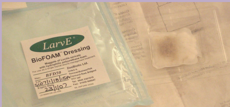
Figure 7. The LarvE BioFOAM dressing.

Outer dressings should be checked or changed on a daily basis. Exudate will be a red/brown colour and this should not be confused with bleeding when the maggots are removed (Figure 8).