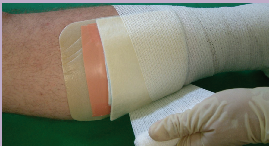
Figure 6. Perforated film dressing is applied, along with an absorbant pad, and is secured with a cotton bandage.

the use of this treatment is appropriate. Both free range LarvE and BioFOAM LarvE are available on prescription as well as within the hospital environment. This allows for continuity of care should a patient be discharged while receiving the therapy.