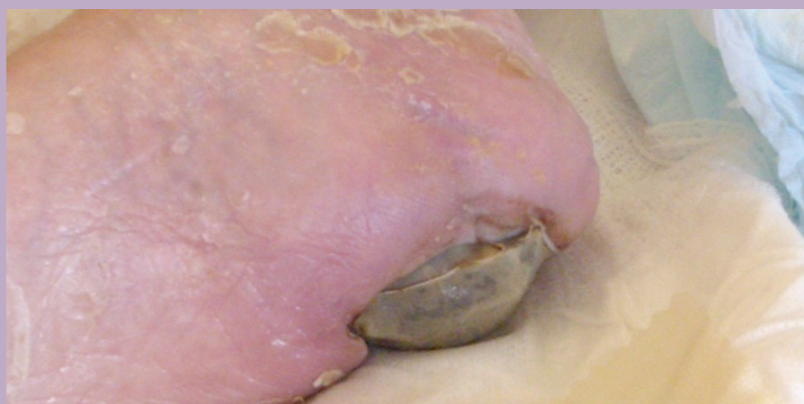
Figure 8. BioFOAM in-situ on a heel ulcer.