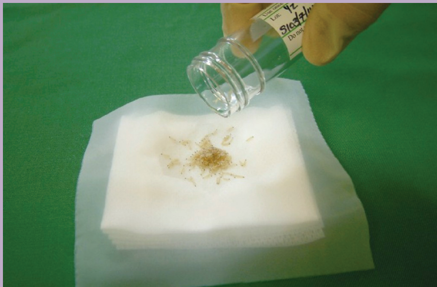
Figure 4. Maggots on sterile net.