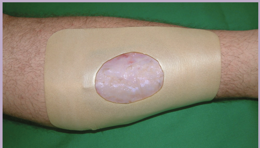
Figure 2. Hydrocolloid dressing in situ to protect the surrounding skin.