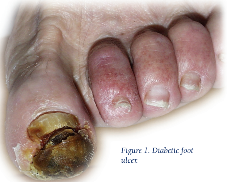
Figure 1. Diabetic foot ulcer.

To gain an understanding of the complexities of diabetic foot ulceration, it is important