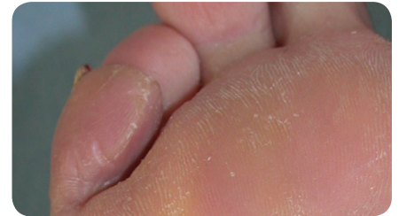
Figure 1. Tinea pedis — as a subtle plantar infection recognised as the dry, dusty appearance.