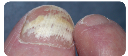
Figure 2b: White superficial onychomycosis.