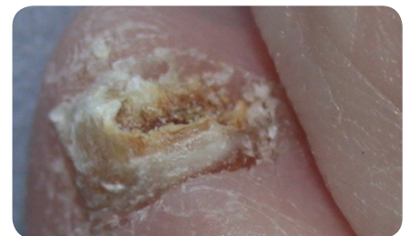
Figure 2c: Total nail dystrophy.

given negative results but clinical suspicion of fungal infection is still high (Weinberg et al, 2005).