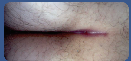
Figure 2. Patient 1 towards the end of their treatment. The wound has less exudate and is progressing to healing.