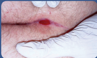
Figure 4. Patient 2 near the end of treatment.