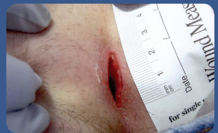
Figure 1. Patient 1 at initial assessment.

The patient was fit and healthy and had presented with an abscess which was incised and left open for secondary healing and drainage. The wound measured 2.5cm in