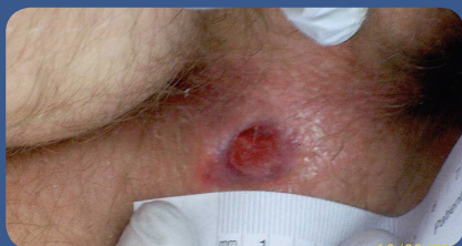
Figure 6. Patient 3 near the end of treatment, exhibiting no depth to the sinus.

level indicating the wound had progressed through the inflammatory stage to granulation (Figure 2). The patient found both the Medihoney gel and the secondary absorbent dressing comfortable. The patient was not discharged from the clinic for a further three weeks as on the final visit, the patient had split the scar area due to excessive physical exertion. No Medihoney was necessary at this time as the wound was relatively minor.