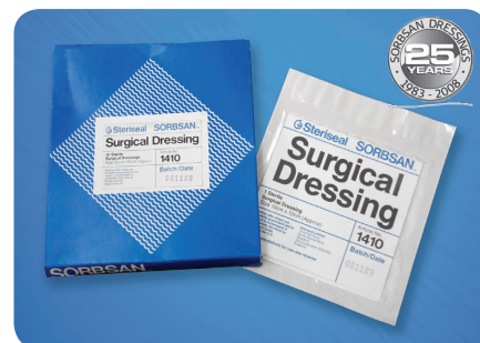
Figure 1. 1980s packaging of the original Sorbsan.

Sorbsan (Unomedical, Redditch) is made from a naturally occurring polysaccharide found in brown seaweed. The species used in Sorbsan is Laminaria and Ascophyllum which occur in abundance off the coast of Scotland (Williams, 1994). Sorbsan interacts with the exudate from the wound to form a hydrophilic gel. Essentially, calcium ions in the calcium alginate extracted from the seaweed are replaced by Sodium ions found in serum or wound exudate. This exchange of ions allows the alginate fibres to absorb fluid and swell, progressively transforming into a gel at the wound surface (Thomas and Loveless, 1992). It is now commonly used in the management of cavity wounds, surgical wounds, abscesses and sinuses in place of traditional ribbon gauze.