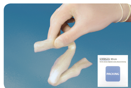
Figure 4. Sorbsan Packing