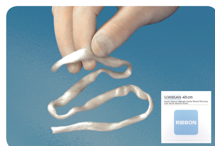
Figure 3. Sorbsan Ribbon