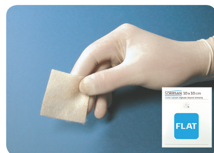
Figure 2. Sorbsan Flat

Sorbsan Plus range is even more absorbent and is available in a non-adhesive or self-adhesive version. It has a two-stage absorbing action to help keep exudate away from the peri-wound skin so reducing maceration. The self-adhesive range is shower-proof and the non-adhesive range is effective underneath compression. Collier (1996) undertook a clinical evaluation of Sorbsan Plus dressing. The study involved four patients and the author acknowledged that this was a small number of patients, but highlighted the following benefits: