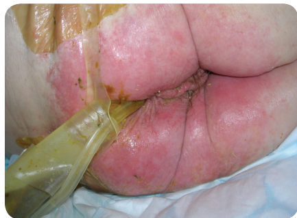
Figure 3. A faecal management system was inserted in an attempt to deal with the patient's faecal incontinence.

The patient developed pneumonia post-operatively and was subsequently admitted to