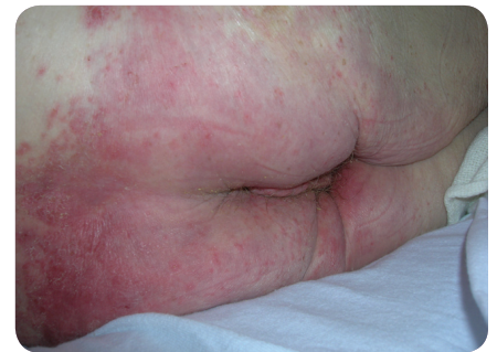
Figure 4. Eventually, the patient's wounds were healed and the skin remained red and irritated but intact.

Optimal wound healing requires a moist environment and the accumulation of dry necrotic tissue impedes this process. Because of their ability to provide moisture, hydrogel-based dressings have been recommended as the best choice