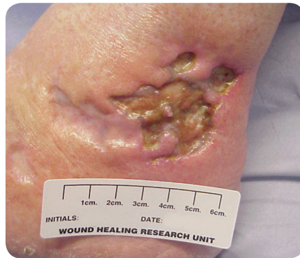
Figure 1. Case study 1: initial presentation of the lower lateral malleolus.

During the course of treatment one patient achieved complete healing, five patients achieved between 30–94% reduction in wound surface area and three showed evidence of epithelialisation. One ulcer increased in size by 10% although the wound