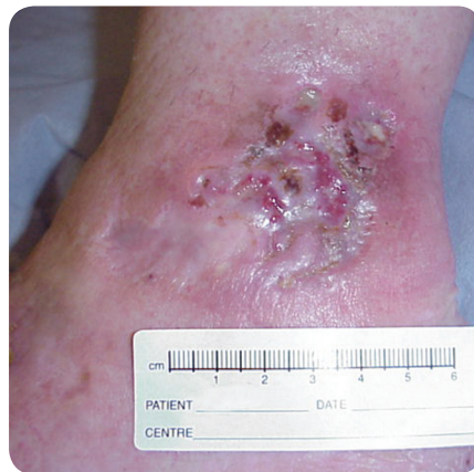
Figure 3. Case study 1: the lower lateral malleolus after five weeks of treatment with Acticoat Moisture Control.

bed was healthy and granulating. Although two were unable to tolerate the dressing due to discomfort on application, this was not a particular concern as this had previously been documented in other published literature with patients using silver-containing dressings (Sibbald et al, 2001; Dowsett, 2003; Lansdown, 2004). This report discusses four of the cases where Acticoat Moisture Control was used to successfully manage four different types of chronic wound.