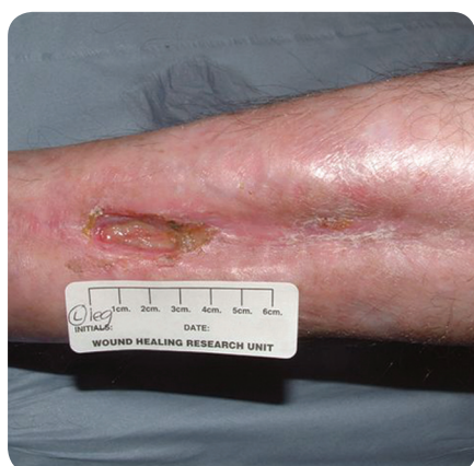
Figure 7. Case study 2: the patient's left leg after 12 weeks of treatment with Acticoat Moisture Control.