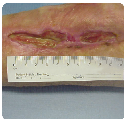
Figure 5. Case study 2: initial presentation of the patient's left leg.