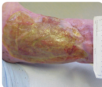
Figure 12. Case study 4: the leg after one week of treatment with Acticoat Moisture Control.

The patient had previous ulceration to her toes, which had since healed. She had suffered with recurrent wound