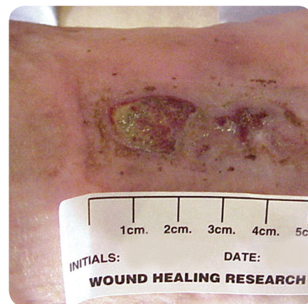
Figure 10. Case study 3: the right medial malleolus after 15 weeks of treatment with Acticoat Moisture Control.

The patient was a 71-year-old woman who lived on a farm with her family. She had a 13-year history of chronic venous leg ulceration to her right gaiter and medial malleolus regions. She previously achieved complete healing, but the current ulceration had been present for four years. Her main complications had been recurrent infections and episodes of osteomyelitis which were confirmed by a bone scan. She had been treated with a variety of different