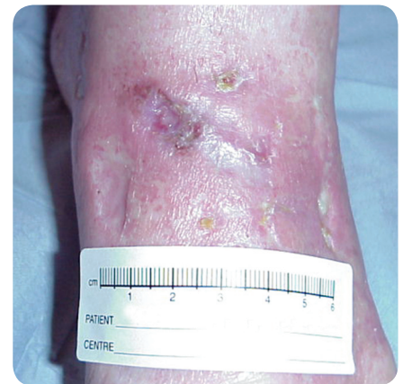
Figure 4. Case study 1: the upper lateral malleolus after five weeks of treatment with Acticoat Moisture Control.

bendroflumethazide. Other prescribed medication included co-codamol, tramadol and amitriptylline as analgesia for ulcer-related pain.