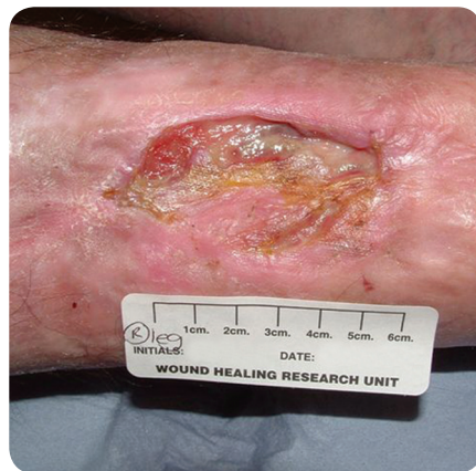
Figure 8. Case study 2: the patient's right leg after 12 weeks of treatment with Acticoat Moisture Control.

static wound edges. Evidence of clinical infection was also seen with visible erythema, inflammation and malodour. The surrounding skin was dry and flaky with extensive atrophie blanche.