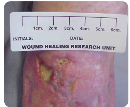
Figure 2. Case study 1: initial presentation of the upper lateral malleolus.

The patient was a 64-year old retired woman who lived with her husband and had a past medical history that included breast cancer for which she had surgery and subsequent radiotherapy. She also had a laminectomy and suffered from hypertension which was being treated with felodipine and