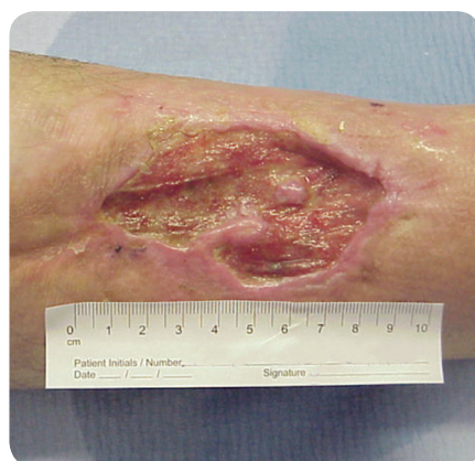
Figure 6. Case study 2: initial presentation of the patient's right leg.