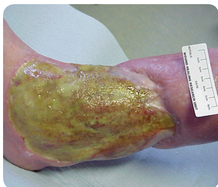
Figure 11. Case study 4: initial presentation of the patient's leg.

fibrin (Figure 10). The wound surface area had decreased to 2cm 2 in total, a reduction of 67% since commencing treatment. The surrounding skin was no longer macerated although erythema and oedema persisted. Acticoat Moisture Control was discontinued at this point as it was no longer indicated as exudate production was minimal and there was no evidence of further infection.