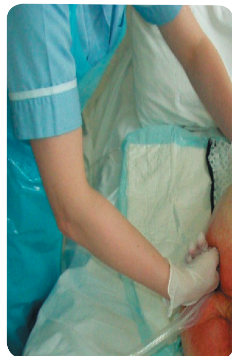
Figure 1. Flexi-Seal® FMS is easily inserted into the patient's rectum.

with water or saline to aid retention, and which is easily inserted into the patients' rectum (Figure 1). The catheter is attached to a closed-end collection bag. The FMS is suitable for the collection of liquid or semi-liquid stools and has a port to allow for the flushing of the system if required.