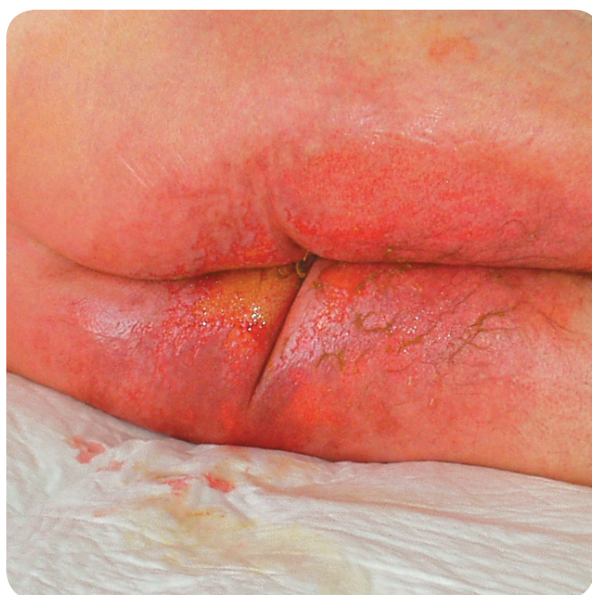
Figure 2. Extreme excoriation of the peri-anal region.