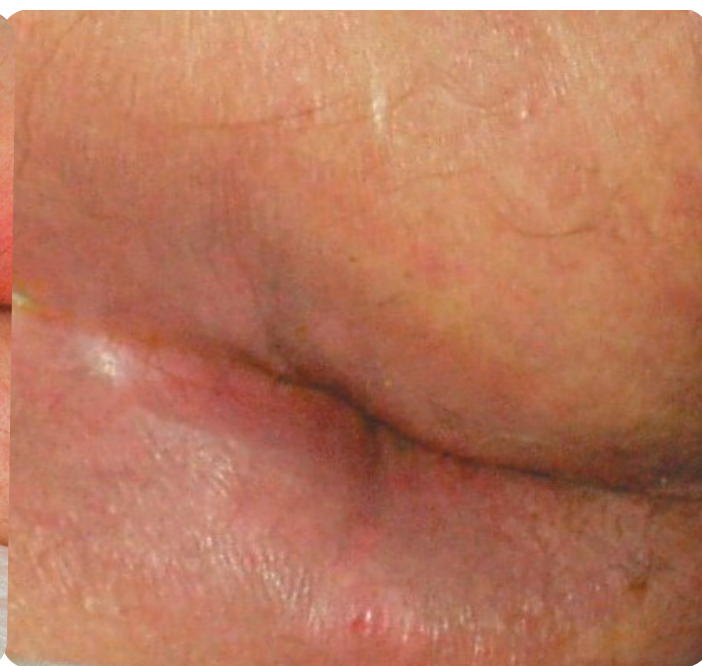
Figure 3. By day 7, skin integrity had returned to normal.

This paper will now report on the outcome of the use of the FMS in three case studies.