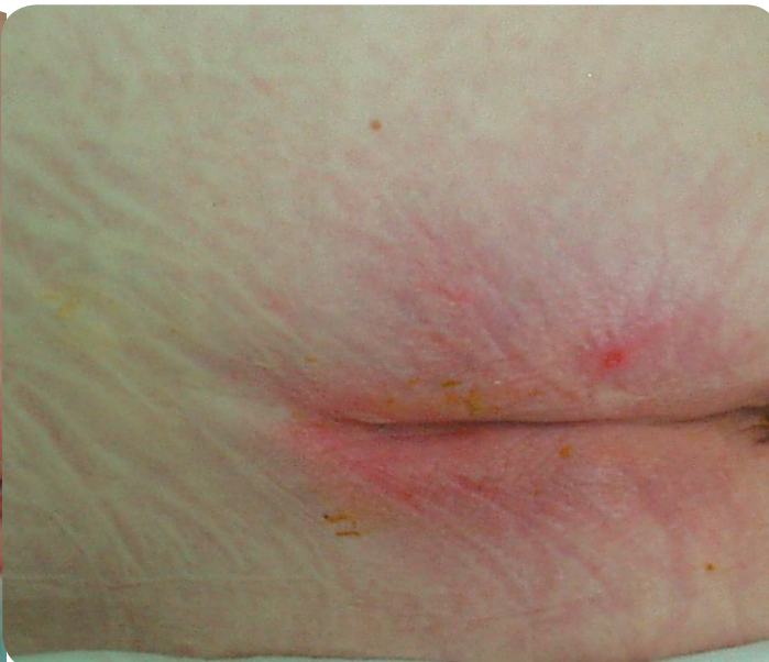
Figure 7. Marked improvement within a 24-hour period.

unit. Based purely on nursing time, linen and laundry, and assuming the patient is changed (due to faecal incontinence) three times a day, the cost would be £78.96 daily or £550.83 per week. Flexi-Seal® FMS costs £250. The system can stay in place for up to 29 days, making it extremely cost-effective.