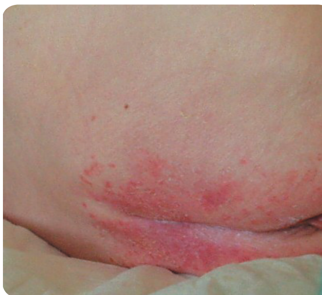
Figure 6. Perineal dermatitis.