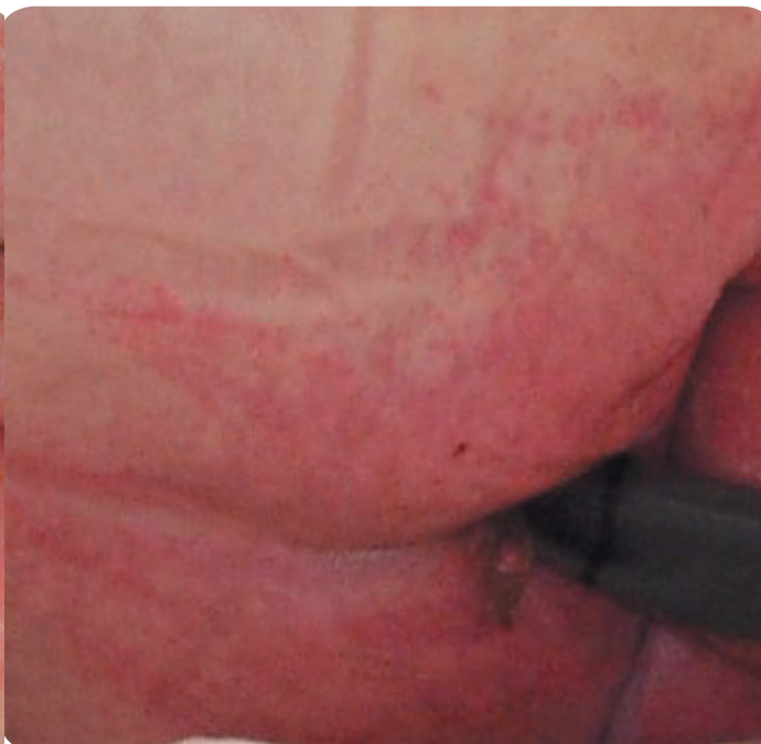
Figure 5. Perineal dermatitis was reduced within 24 hours of Flexi-Seal® FMS insertion.

Following insertion of the FMS, perineal dermatitis caused by faecal incontinence was reduced within 24 hours (Figures 4 and 5).