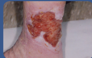
Figure 4. Continued granulation and epithelialisation; wound is pale and less vascularised.

The patient's wound progressed to a healing state passing through the stages of wound healing. Continuous assessment is essential to move the wound effectively on to the next stage through appropriate dressing selection. Sometimes it is not easy to make the right decision, but through the use of an assessment tool, and working with the patient, the decision becomes a common-sense process. WUK