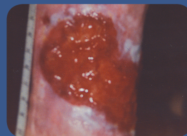
Figure 1. Red and beefy wound with maceration requiring exudate management.

Removing the pain and reducing the exudate was of prime importance and the selection of ActiFormCool was correct for this patient as it met both of these criteria.