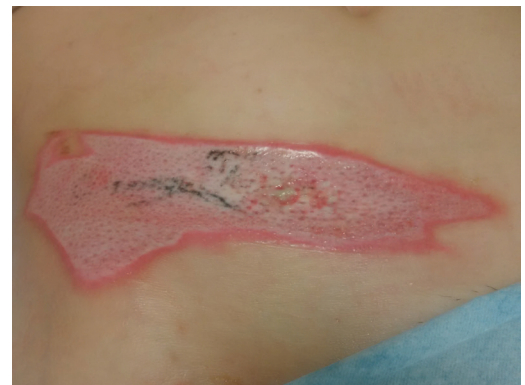
Figure 4. Patient 19 used a hot iron to burn a tattoo on her left abdomen