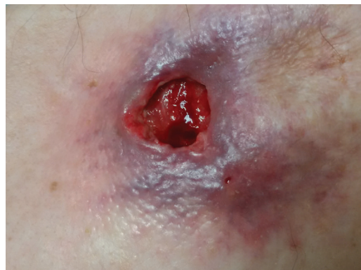
Figure 3. Patient 8's wound was 7 cm deep and caused by a knitting needle