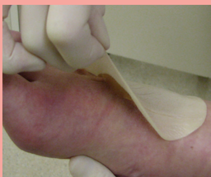
Figure 4b. Use a gentle upward pulling motion to reduce the seal of the dressing on the skin.