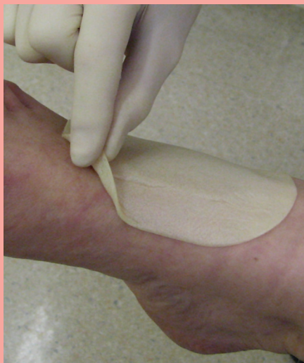
Figure 4a. To remove the hydrocolloid, gently lift the edge of the dressing.