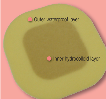
Figure 1. Example of a hydrocolloid dressing.

When applying a hydrocolloid on a DFU it is important to address the following: