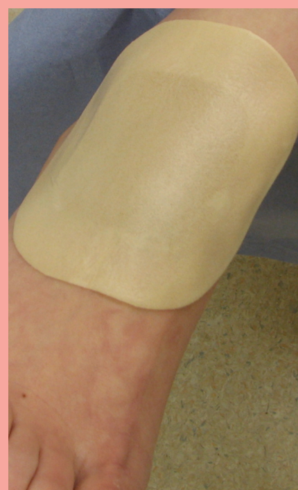
Figure 2. Hydrocolloid on the foot.