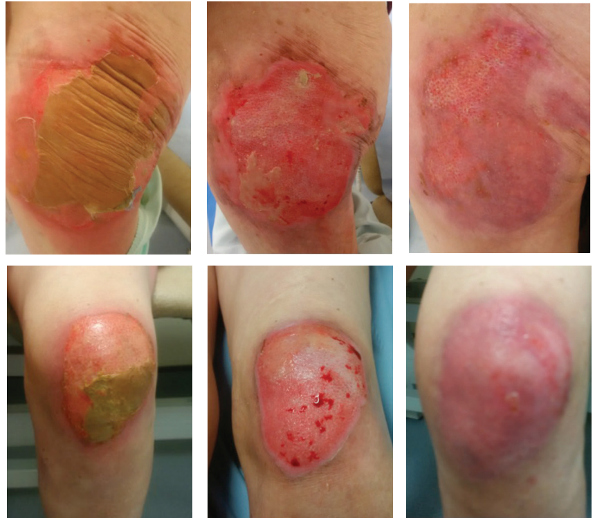
Case study. A female patient, aged 87, hypertensive, stable type 2 diabetes, attended the walk-in centre with 10-day-old burns to left hip, thigh and patella from accidentally pouring scalding hot water over herself. She is independent, self-cares at home and has a good strong family support when required. She had been caring for these wounds herself before her daughter found out and brought her to the walk-in centre. Wounds continued to be dressed with adhesive silicone foam dressing. She was discharged from care at week 10. Top (left to right): hip on day 0; week 1 (two applications of Granulox); week 10 (10 applications of Granulox). Bottom (left to right): Patella, day 0; week 1 and week 10.