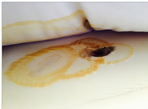
Figure 2. An example of a mattress with strikethrough.

the size and scope of the problem that it came to the attention of senior procurement and clinical managers (Stewart, 2010). In response, UK industry produced and promoted a guide for the care, cleaning and inspection of healthcare mattresses (BHTA, 2011). The aims of this report were supported by equipment manufacturers.