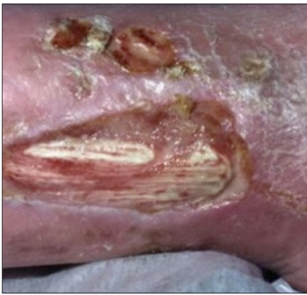
Figure 4. Tendon visible in the wound bed. Fibrous, stringy appearance of white tissue.