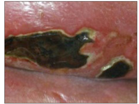
Figure 1. Necrotic tissue. Autolytic debridement is beginning to occur at the wound margins where the black necrotic tissue is pulling away.

Given the right environment, slough will usually disappear as the inflammatory stage resolves and granulation develops. However, in chronic wounds the inflammatory stage can be prolonged and the excessive number of neutrophils results in the release of matrix metalloproteinases (MMPs) which destroy the developing extracellular