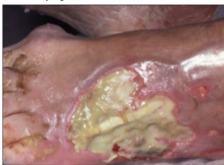
Figure 5. Tendon visible in wound bed covered by slough.

of wound healing, as well as what it looks like, can lead to a misdiagnosis which could have significant implications. It is not unknown for exposed tendon to be mistaken for slough, with attempts made to debride it with dressings. Tendon can present as creamy white in colour and can appear as thick substance in a wound bed. However, tendon will be fixed and firm and stringy in texture. It will move as the limb or joint flexes (Figures 4 and 5). Exposed tendon must not be allowed to dry out or it could snap; it is important to be kept moist. Referral must be made to a specialist.