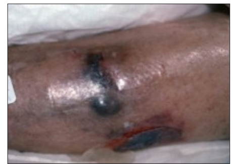
Figure 2. Haematoma is a collection of blood underneath the skin surface.