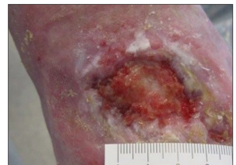
Figure 6. Granulation tissue is bright red and bumpy.

Epithelialisation is the final stage of wound healing, during which epithelial cells (new skin cells) migrate across the wound surface to cover it. The cells arise from hair follicles,