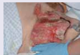
Figure 2. Wound at 5 days