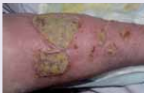
Figure 1. Wound at baseline

Dressing change day 5: Two days later, slough had significantly reduced, revealing 90% granulation in the wound bed (Figure 3). Malodour had resolved and the patient rated pain as a 2 on the VAS. The patient was discharged back to the community at this time.