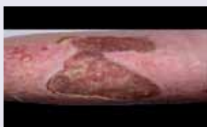
Figure 3. Wound at day 5