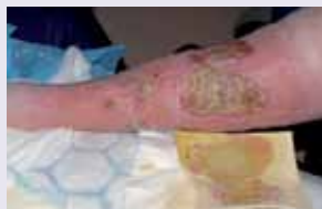
Figure 2. Wound at day 3