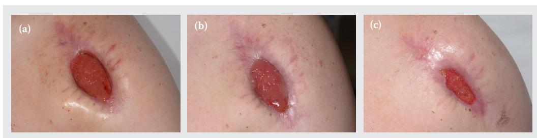
Figure 1. Mr M’s post-surgical wound with friable/bleeding tissue at (a) presentation, and (b) weeks 2 and (c) 4.

“ACTISORB® Silver 220 (Systagenix) contains silver to reduce bacterial load and the dressing allows exudate to filter through, removing it from the wound surface.”