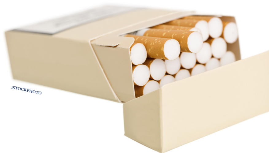
Figure 2. Smoking is a risk factor for postoperative complications, such as pneumonia, infections and impaired wound healing. These can be reduced by pre-operative stop-smoking intervention 6 to 8 weeks before surgery.

“Trials investigating smoking cessation and wound healing have found universal improvements in reducing infection rates, complications and speed of wound healing.”