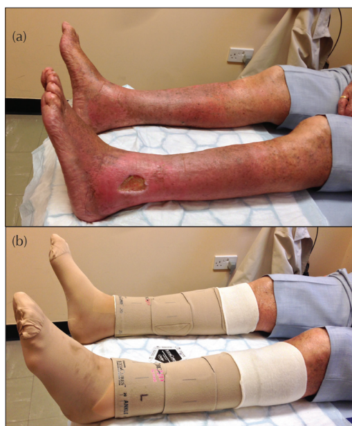
Figure 3. Mr C's leg (a) with, and (b) without, Juxta CURES (medi UK) applied.

There will always be patients who find it difficult to adhere to compression, despite it being considered the best treatment option for their leg ulcers. Juxta CURES is an alternative to bandages and stockings. This case study review only examined complex cases; Juxta CURES was not used routinely as a first-line treatment option to provide compression therapy as current local protocol is to use compression bandages. Nurses and patients in the author's clinic report Juxta CURES to be quick and easy to apply, making it likely to reduce the amount of time clinicians spend on dressings and the number of clinic visits patients require. There is no reason why this device cannot be used for routine venous leg ulcer management.