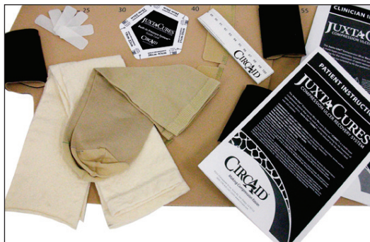
Figure 1. Juxta CURES (medi UK).

With all this choice available, it should be possible for the practitioner to select a suitable compression system that their patients find comfortable to wear but, in practice, patients often find compression difficult to tolerate. There is clear, documented evidence outlining the many reasons for this, such as not understanding the theory of compression, increased pain on application, previous poor experience of therapy, and social pressures, such as being unable to work (Hopkins and Worboys, 2005; Moffatt, 2007; Moffatt et al, 2009).