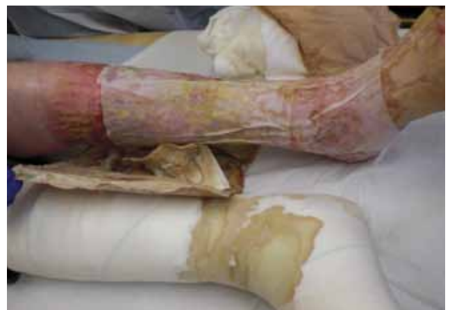
Figure 2: Poor control of exudate: dressings are soaked with exudate and strikethrough is evident