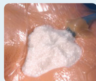
Figure 1. Gauze-based NPWT using a drain to apply suction.

Treatment should be stopped when the treatment goals have been reached. If any adverse events occur, such as skin reactions, pain or bleeding, NPWT should be stopped.