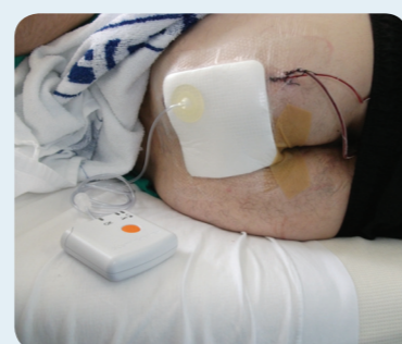
Figure 2a. Single-use, canister-free NPWT system (PICO) applied to a patient with a muscle flap.