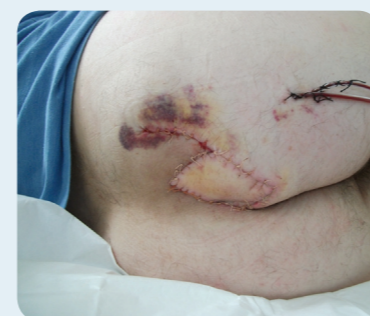
Figure 2b. Following seven days of therapy, the flap was well perfused and exudate levels were minimal.