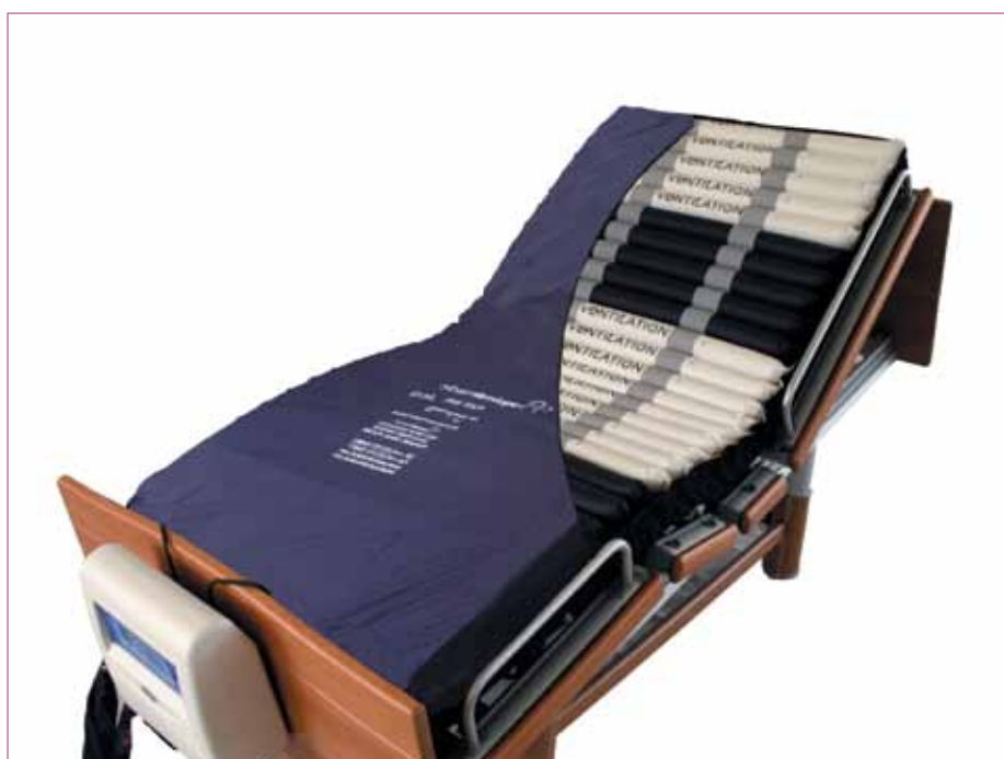
Figure 1. Squirrel Diamond Dynamic Hybrid Mattress showing its stable array of air chambers. Clients report that repositioning and transfer is easier. (Pictured on Volker 3080 nursing bed).

In a night-time audit carried out by Shanahan and Evans (2009), some 21.5% of beds audited had both dynamic air mattresses and bedrails in simultaneous use. Interestingly, the audit did not specify if bed rail height (as measured from the mattress to the top of the bed rail) was assessed. The relevance of this is that the safety standards BS EN1970 specify that the minimum height of a bedrail should be 22cm from the top of the mattress. Concerned at the potential for serious or fatal injury, in 2001, the Medicines and Healthcare products Regulatory Agency (MHRA) issued advice in its publication 'The Safe Use of Bedrails DB 2001(04)'. In 2006, (after the Shanahan and Evans audit) this guidance was amended