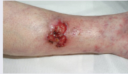
Figure 3: Healthy clean granulating wound bed. This wound is suitable for management with a hydrocolloid dressing