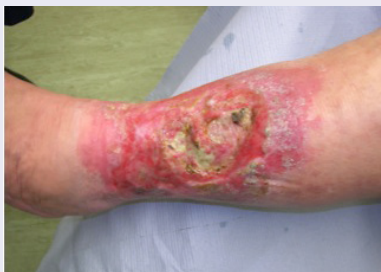
Figure 4: Evidence of extensive maceration caused by inadequate management of exudate