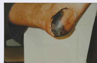
Figure 6: Flap laceration one week following injury

Following discussion with the patient it became apparent that his priority was to continue working. This required a dressing regimen that would allow him to wear his working shoes and to remain active. In considering the available options it was felt that a hydrogel would not stay in place and remain effective and therefore a hydrocolloid dressing was chosen. As well as protecting the wound, the dressing facilitated autolytic debridement, fitted snugly around the injury and the young man was able to redress the wound himself and continue working. Improvement was seen at two weeks and the wound healed within a further four weeks, despite only short periods of rest.