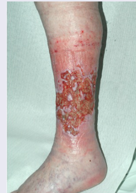
Figure 5: Large venous leg ulcer, which could be managed using a hydrocolloid dressings. It is important to select an appropriately-sized dressing that covers the whole of the wound plus a margin of 2-3cm

frequent dressing changes. Hydrocolloid dressings have the ability to be left in place for up to seven days making them an ideal primary dressing under compression systems.