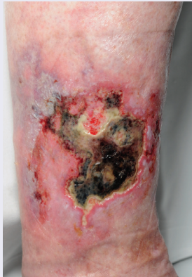
Figure 2: Venous leg ulcer with a variety of tissue types at the wound bed, including dehydrated slough, which is turning into eschar and some smaller areas of healthy granulation tissue. This wound is suitable for management with a hydrocolloid dressing