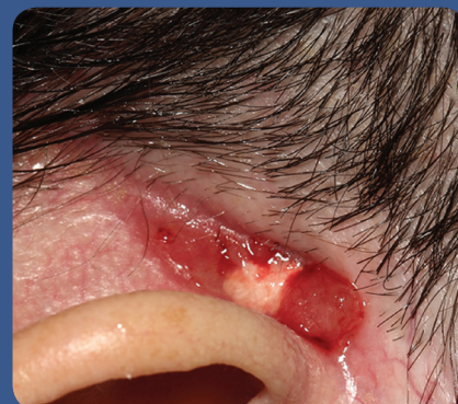
Figure 6. Wound extended to muscle and periosteum.

At this stage, the patient was able to manage the dressings himself, which allowed him to undergo rehabilitation and limb-fitting. Following discharge he was provided with contact details for the specialist nurses if he needed advice or further appointments.