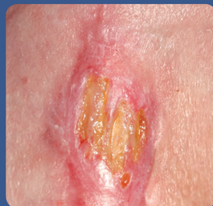
Figure 4. Wound remained infection-free.