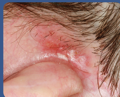
Figure 8. The wound progressing to healing.