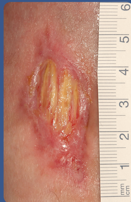
Figure 2. Granulation tissue had increased.