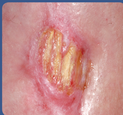
Figure 3. Continued reduction in wound size.