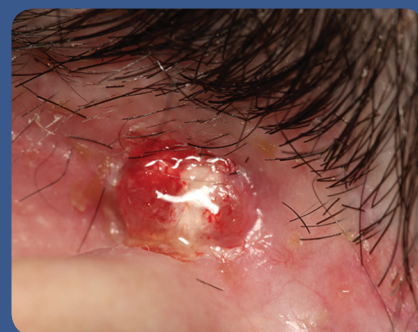
Figure 7. Development of healthy epithelialisation.