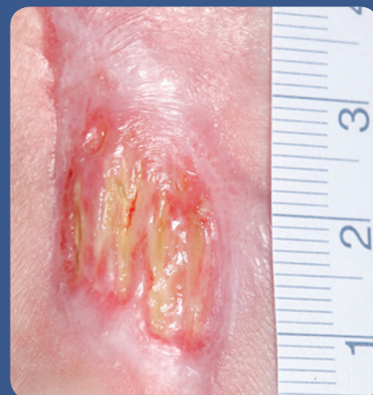
Figure 5. Wound at discharge.

This 44-year-old male patient with a history of rheumatoid arthritis was referred from the district general hospital to the chronic wound care clinic for negative pressure wound therapy (NPWT) treatment of a non-healing wound on the dorsum of his left foot.