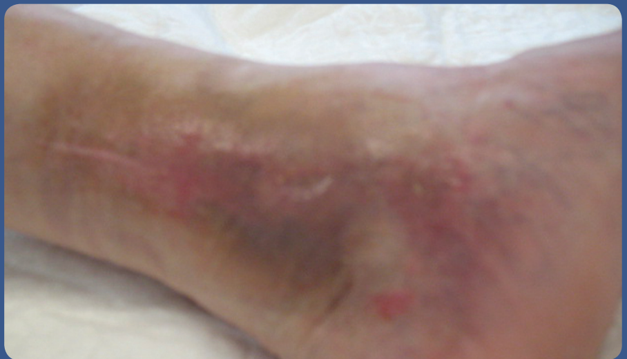
Figure 2. Healed ulcers on 07/07/2010 after four weeks of honey treatment.

and low molecular weight heparin (Musani, 2010; Roche-Nagle, 2010). The aetiological study did not show up the condition of thrombophilia.