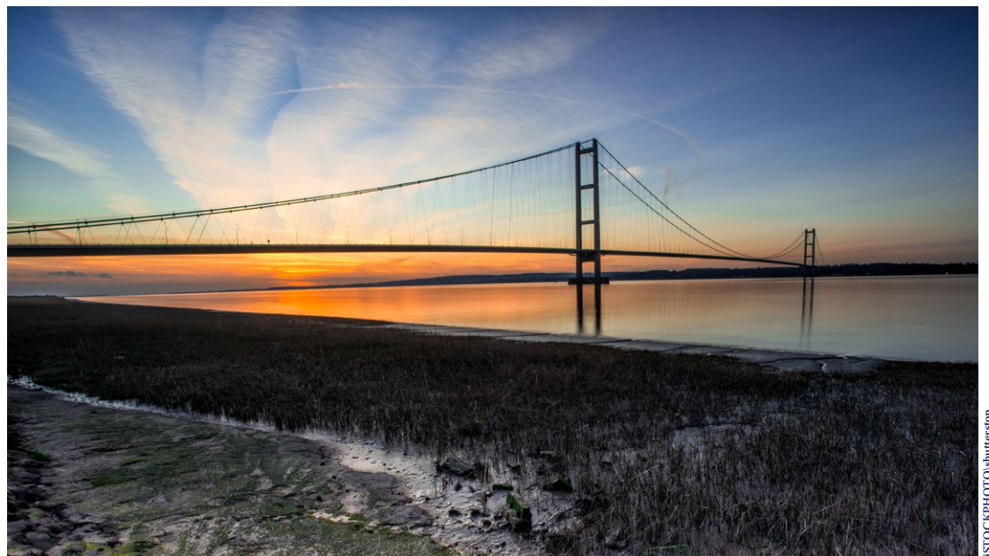
The Humber bridge, East Yorkshire

During the COVID-19 pandemic, as many Leg Clubs have been forced to close their doors or operate in COVID-19 secure environments, we face a significant challenge as some Trusts again question the direct cost of treatment. However, social isolation and mental health is the new battleground, and evidence suggests that unless this is addressed then physical health will rapidly deteriorate also. The Leg Clubs epitomise the holistic nature of healthcare and