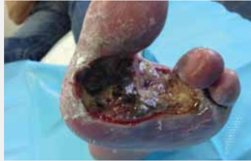
Figure 1: The wound prior to forefoot amputation.

The wound was very painful, preventing sharp debridement, and a below-knee amputation was considered. Larval therapy was applied to help save the limb (Figure 3). The wound responded well and 3 weeks after larval therapy and the application of a non-adherent dressing, the wound was healing well (Figure 4).