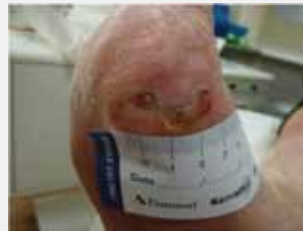
Figure 4: 22 days after the second application of larvae.