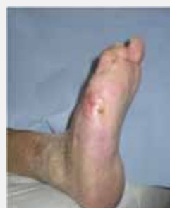
Figure 6: The wound went on to heal uneventfully.