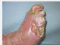
Figure 4: After the first application of larval therapy.