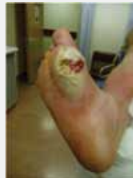
Figure 1: An initial single larval treatment was applied to the ulcer.

Following this second application of larval therapy, the wound made remarkable progress towards healing (Figure 4). At each follow-up visit there was a reduction in wound size and volume. The wound healed (Figure 5) uneventfully 10 weeks following the second application of larvae.