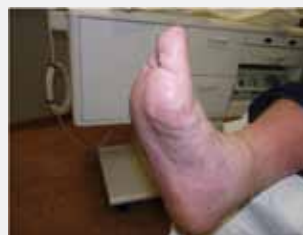
Figure 5: The wound had healed by 12 October — 10 weeks following the second application of larval therapy.