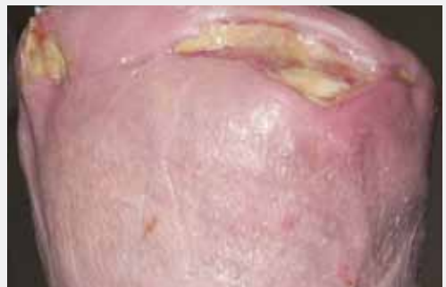
Figure 4: Three weeks post larval therapy and moist wound healing. The wound is in a healing trajectory.