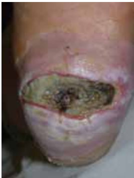
Figure 1: Debridement is indicated to remove slough and necrotic tissue in the wound bed. Such non-viable tissue can act as a nidus for infection. Larval therapy may be the preferred method where the wound is too painful for sharp debridement.

Recognition of non-healing demands careful reassessment of the wound to identify barriers to healing. The earlier the wound healing problems are detected, the better the outcomes for the patient (Vowden, 2011).