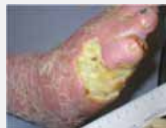
Figure 3: The foot prior to the application of larval therapy.