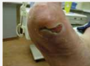
Figure 3: Characteristic wound appearance at the second larvae application. There was a translucent sloughy film coating the wound bed and pale, poor-quality granulation tissue. The wound edges are undermined.