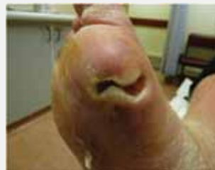
Figure 2: The wound developed a static appearance despite the application of larvae.