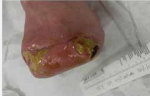
Figure 2: Post surgery the wound dehiscd and became sloughy.