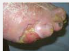
Figure 5: After the second application of larval therapy.