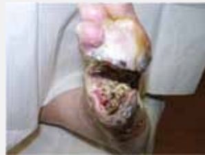
Figure 2: The wound after the second application of larvae.