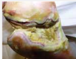
Figure 1: Appearance of foot just prior to the first application of larvae.

After two applications of larval therapy, the wound was slough free and there was evidence of granulation tissue (Figures 4 and 5). The wound went on to heal uneventfully (Figure 6).