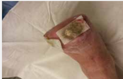
Figure 3: Larval therapy in situ prior to removal.