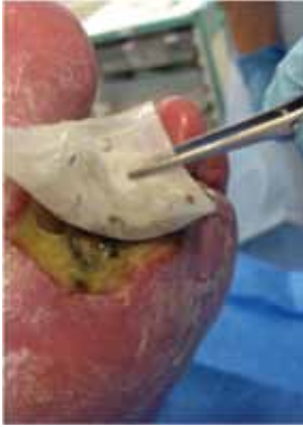
Figure 3: Larval therapy being applied to a sloughy wound after toe amputation.

Free range larvae can be applied directly to the wound and retained in a special dressing system for a maximum of 4 days. However, they can be very difficult to contain due to problems in applying the dressing to the foot/toe area and subsequent movement of the foot during walking.