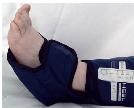
Figure 1. Example of Maxxcare Pro Evolution Heel boot offloading the left foot