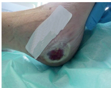
Figure 4. Day 0: The wound measured 3.4cm 2

The Maxxcare Pro Evolution Heel boot has a non-slip base to help patients to move from bed to chair. After application of the Maxxcare Pro Evolution Heel boot, the patient reported that her foot felt more comfortable and the foot plate of her wheelchair no longer felt uncomfortable. By day 7, the wound had decreased in size by 1.9cm 2 and the wound continued to improve. On day 14, the wound had decreased to less than 0.5cm 2 in surface area (Figure 5). Due to her positive experience, she continued to wear the boot post-evaluation.