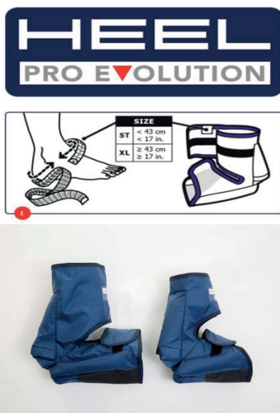
Figure 2. Size guide

Implementing an effective heel protection programme involves adopting a multi-faceted approach which includes performing a risk assessment and undertaking a comprehensive examination of skin integrity in those patients deemed at high risk of pressure damage (NICE, 2014). The strength of evidence suggests that the ideal pressure-redistributing techniques for offloading the heels should reduce pressure, friction and shear; separate and protect the ankles; maintain heel suspension; and prevent foot drop (Black, 2004).