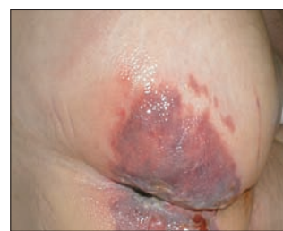
Figure 5: Pressure ulcer to the sacrum, caused by the combined effects of pressure and shear