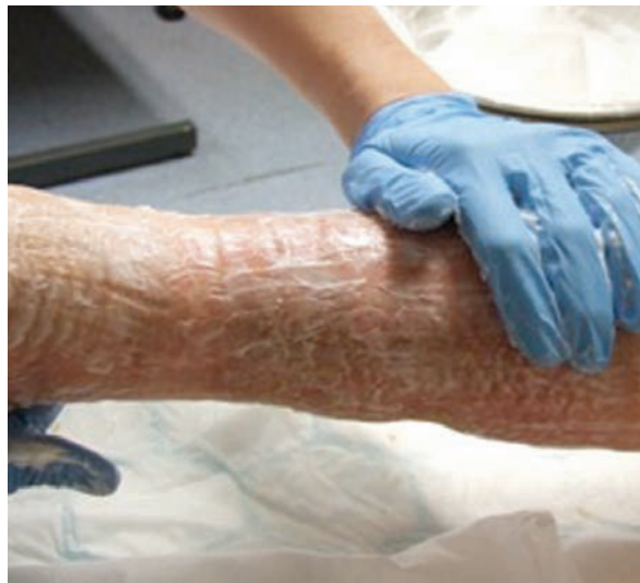
Figure 2: Application of a moisturiser using a downward movement (courtesy of Wingfield, 2011).

It is important to advise the patient/ carer not to stop treatment once the condition is controlled as emollient therapy will help to prevent future exacerbations (Patel and Yosipovitch, 2010).