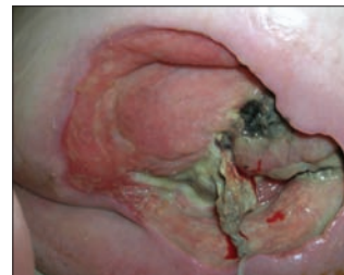
Figure 4: Pressure ulcer located on the sacrum, presenting with exposed bone, slough and granulation tissue

Staff and carers involved in looking after individuals at risk, or with existing pressure ulcers should use national guidelines on the prevention and treatment/management of pressure ulcers to ensure that best practice is provided. In addition, they should follow local protocols. This includes protection of vulnerable adults — that is, anyone aged 18 or over who is in need of community care services and is unable to look after themselves (DH, 2000).