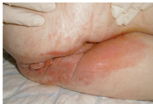
Figure 8: Incontinence skin reaction

The management of incontinence requires individual assessment of the causes of the problem and although it is essential to maintain cleanliness of the skin, consideration should be given to the use of urinary and faecal collection systems to protect skin integrity (Ousey et al, 2012). It is important that all nurses undergo training in incontinence and associated incontinence care and to have periodic refresher courses to keep up-to-date.