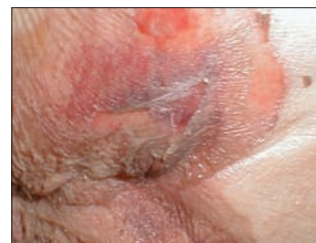
Figure 6: Pressure ulcer located on the sacrum, caused by pressure and friction. The effects of friction cause epidermal cell stripping