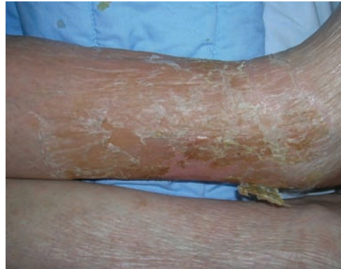
Figure 1: Dry skin

Pruritus can cause discomfort and in severe cases it can lead to disturbed sleep, anxiety and depression. Anxiety and stress can make itching worse and often there is a psychological element to pruritus. Constant scratching can damage the skin, reducing its effectiveness as a