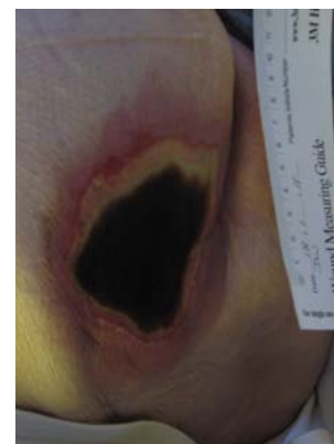
Figure 10: Skin failure in a patient at the end of life