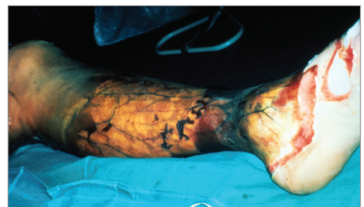
Figure 3. Full-thickness flame burn circumferentially involving the leg

in wounds that are pink or red in colour, have a wet exuding surface, are painful and have a capillary refill ( Figure 1 ). As the dermal appendages are intact in these burns, there is no need for surgical intervention and they can be