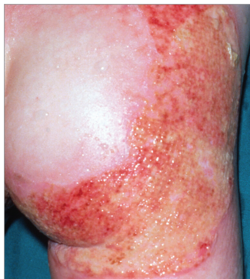
Figure 4. FLAMAZINE® coating the surface of a superficial partial-thickness scald, giving it the appearance of a deeper injury

Specialised burn services use Laser Doppler Imaging (LDI) as an adjunct to clinical evaluation for increased accuracy in identifying burns that