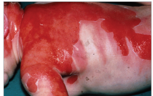
Figure 1. Superficial partial thickness scald

A thorough clinical assessment is essential to accurately classify burns as those involving either partial or full skin thickness based on the physical characteristics of the wound. These characteristics include presence of blistering, wound bed colour, sensibility and capillary blush on release of digital pressure ( Table 1 ). The presence of a break in epidermal continuity is an essential feature of burns. Redness in the absence of epidermal breakdown, such as that seen in superficial sunburn, although painful, does not require intervention apart from symptomatic treatment. Partial thickness burns are associated with epidermal blistering and are further divided into superficial (involving the superficial and mid dermis) and deep (involving deeper part of the dermis) partial thickness burns. In superficial dermal and mid dermal burns the cutaneous nerves, dermal vascular plexuses and appendages located in the deep dermis are intact, resulting