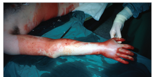
Figure 2. Circumferential deep dermal burn over arm, forearm and hand. Note the patches of full-thickness (white) burn over the extensor forearm and hand