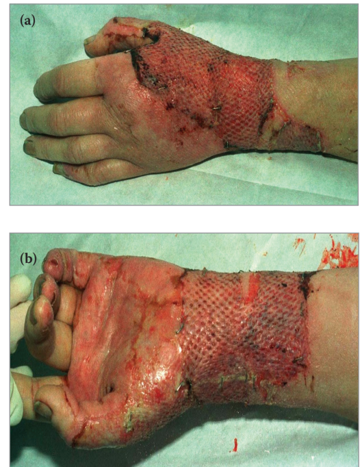
Figure 7. (a) Meshed skin graft to the radial border of the hand following excision of a deep dermal burn (b) Meshed skin graft to the flexor aspect of wrist following excision of a deep dermal burn

Excision of the burn is performed in the operating theatre under aseptic conditions with the ambient temperature tightly regulated to minimise the risk of hypothermia, especially in more extensive burns. The surgical techniques available for excision of the burn include tangential excision and fascial excision, and selection is dependent on the depth of injury, risk of bleeding and general condition of the patient. Tangential excision is used to excise deep dermal and full-thickness burns and allows removal of the burn in wafer-thin layers until viable tissue (dermis or subcutaneous fat) is encountered, thus minimising the excision of healthy tissue. Punctate bleeding and healthy colour as well as texture indicate viability of tissue deep to the burn. This technique has the advantages