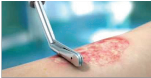
Figure 6. Versajet® II (Smith & Nephew) being used to debride a burn

after an accurate assessment of the depth is made by an experienced clinician, as well as a decision to pursue conservative treatment.