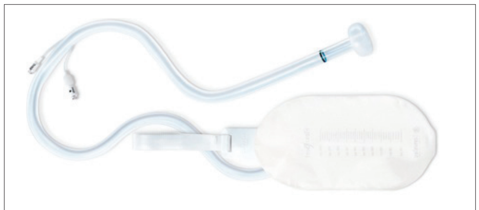
Figure 1: The Flexi-Seal faecal management system.

NICE (2007) Clinical Guideline 49. Faecal incontinence; the management of faecal incontinence in adults . NICE, London