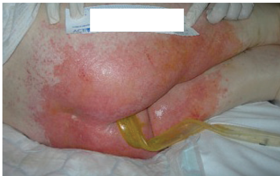
Figure 3: Patient with faecal management system in situ, in this case inserted too late to prevent IAD.

Skin protection involves the clinician employing good practice in more than one area — the practise of skin cleansing; use of appropriate containment devices; and, where necessary, the use of an effective barrier cream, all of which can be employed to defend the skin from the harmful effects of incontinence. WUK