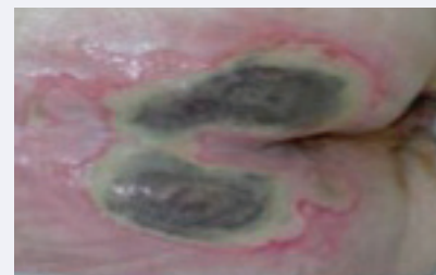
Figure 2: Differentiating between types of skin damage.

One or more wounds/skin lesions caused by a combination of pressure, shear, friction and moisture. May occur over bony prominences and there may also be skin damage in the perineal area, the natal cleft and between the thighs. The lesions may be partial or full thickness in appearance and may range from non-blanching erythema to necrotic and sloughy wounds. These wounds are at risk of infection so may appear green in colour depending on the types of bacteria present.