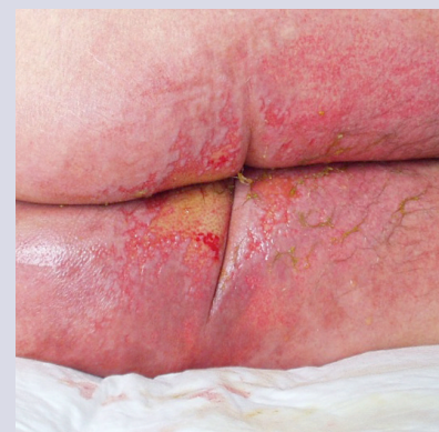
Figure 1: Erythema may be patchy or consolidated.

If the IAD does not improve using these measures, the recommendations for napkin dermatitis in babies and children