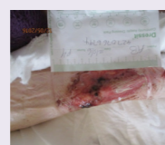
Figure B. Day 21 of treatment with HydroTac®

Clinical evidence for HydroTherapy derives from a number of studies, including a 75-patient, multicentre, open and randomised study; a 403-patient observational study; a 221-patient observational study; a 20-patient community-based study; and a number of case series studies (Ousey et al, 2016b). HydroClean® plus and HydroTac® have been evaluated in terms of debridement and wound cleansing, bacterial sequestration, managing wound exudate and protecting the wound edge, and the impact of patients' quality of life (Table 3).