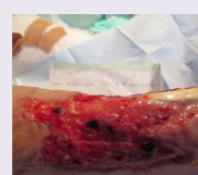
Figure A. Wound prior to treatment with HydroTac®