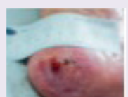
Figure C. Week 8: 16th dressing change after HydroClean® plus and HydroTac® treatment