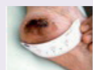
Figure A. Wound prior to treatment with HydroClean® plus

After just 7 days of treatment with HydroTac, the wound showed a reduction in size and the condition of the wound bed had improved; at 14 days there was a reduction in tendon exposure and granulation tissue was beginning to cover the wound. After 21 days of treatment, there was a minimum amount of tendon exposed and a healthy wound bed (Figure B).