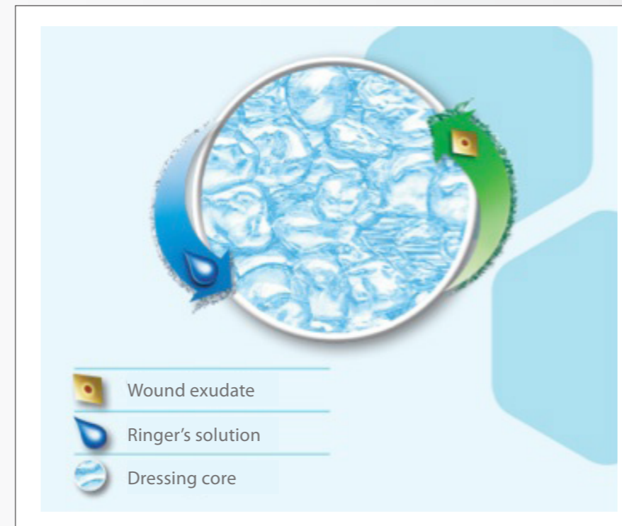
Figure 3. The unique cleansing/absorbing action of HydroClean® plus

HydroTac® continues the beneficial absorption action of HydroClean® plus by absorbing wound exudate into the foam layer. The dressing maintains optimal hydration levels to support wound progression via AquaClear Technology, providing active moisture-release (Box 3) (Smola et al, 2014). In addition, the absorption properties of AquaClear Technology are designed to lead to the accumulation of growth factors within the moist wound environment. The combination of elevated growth factor levels and an optimally hydrated wound bed environment has been suggested to promote epithelial closure (Smola et al, 2016a,b). Versions of HydroTac® are shown in Box 4.