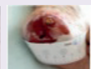
Figure B. Day 4: second dressing change after start of HydroClean® plus treatment