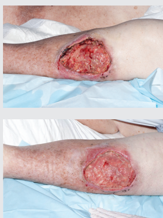
Figure 2a and b: Debridement of haematoma following treatment with larvae

When applying LDT to the lower limb in treating a traumatic haematoma, the leg should be bandaged using a soft protective bandage and secured with crepe, applied lightly from toe to knee. Doing so will keep the therapy in place, aid patient comfort and help reduce surrounding oedema. Good skin care of the surrounding area is also important for reducing inflammatory skin changes, discomfort or itch in line with general washing of the limb. Pain levels should be monitored regularly, as with any treatment, and care decisions related to pain based on individual requirements.