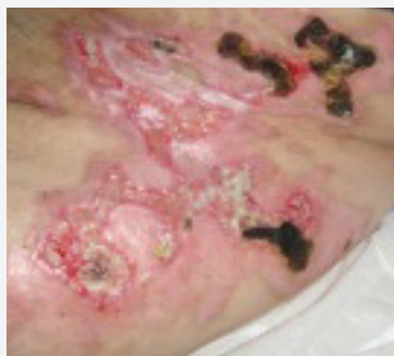
Figure 2. 6 weeks post-injury