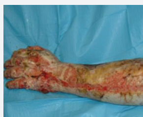
Figure 3: Three days post-larvae