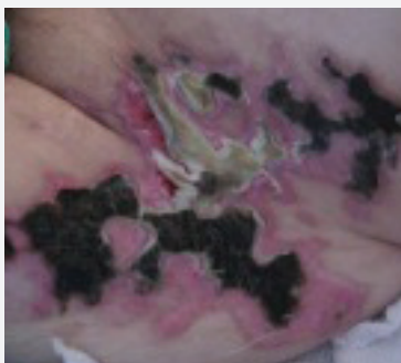
Figure 1. 5 weeks post-injury

Achievement of patient concordance with LDT tends to be the same in patients with burns as those with other wounds (e.g. psychological acceptance, the 'yuck' factor). We have found that patients prefer the larvae in bags. Physical discomfort has not been an issue for patients in our experience.