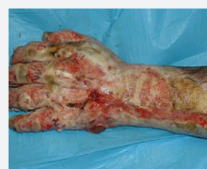
Figure 4: Close-up of hand 4 days post-larvae