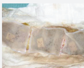
Figure 2: Larvae in situ