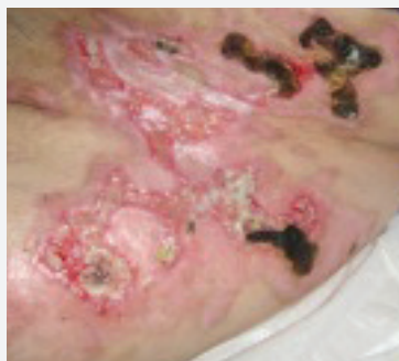
Figure 2. 6 weeks post-injury