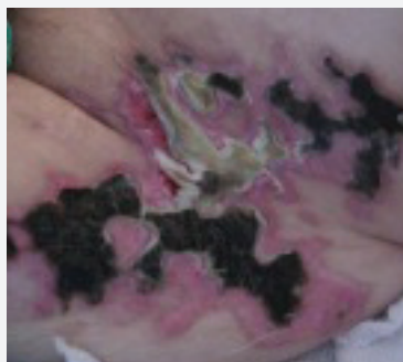
Figure 1. 5 weeks post-injury

Achievement of patient concordance with LDT tends to be the same in patients with burns as those with other wounds (e.g. psychological acceptance, the 'yuck' factor). We have found that patients prefer the larvae in bags. Physical discomfort has not been an issue for patients in our experience.