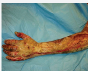
Figure 1: Before larvae

Larvae were applied to the wound using BioBags for 4 days (Figure 2). These were easy to apply and the larvae and we were able to target the burn. The Biobags were held in place with damp gauze and a loose bandage to allow observation of the larvae 48 hours post-application. Prior to starting treatment, the patient had begun moving into a septic episode. However, all clinical signs of infection were reduced after 24 hours. At the end of the treatment period, devitalised tissue had been reduced by the larvae and the wound bed contained much cleaner tissue (Figures 3 and 4). The patient was taken for skin grafting as soon as he was stable to support his rehabilitation.