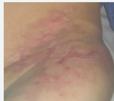
Figure 3. 10 weeks post-injury